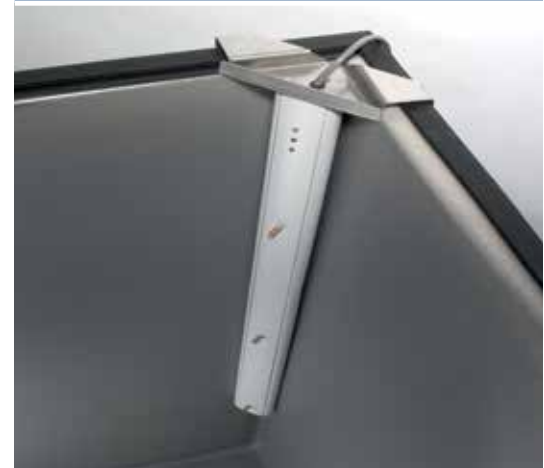
Bin Level Control Sensor