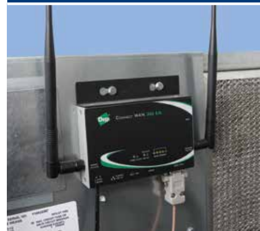
Cellular Modem Gateway