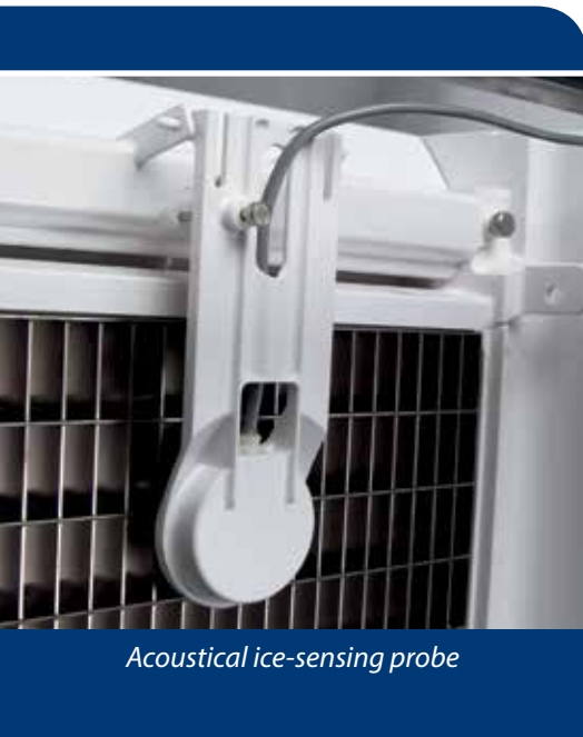
Acoustical ice-sensing probe