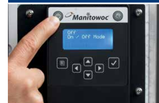
Service data display