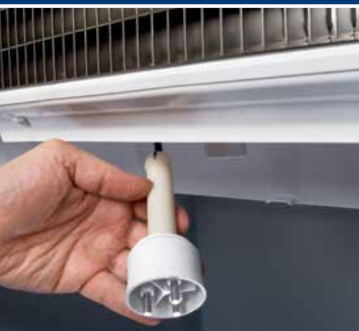
Snap-fit water probe