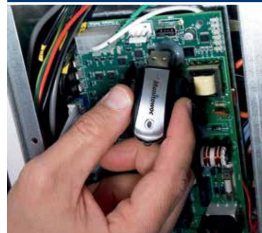
USB Communication Port