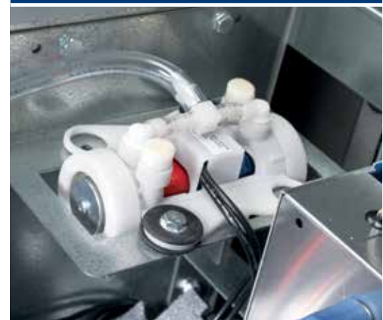
Patented Air-Assist Harvest Technology