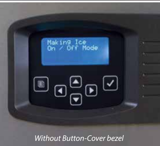
Without Button-Cover bezel