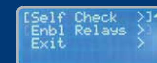
Self-check part diagnostics