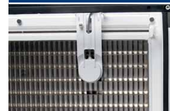
Ice sensing probe