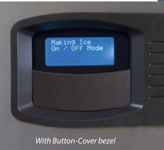
With Button-Cover bezel

For public locations, Button-Cover bezel prevents external menu navigation.